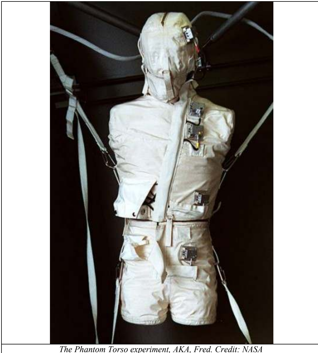
The Phantom Torso experiment, AKA, Fred.

“Free from the protection offered by the atmosphere, cosmic rays bombard us within Space Station, penetrating the hull almost as if it was not there. They zap everything inside, causing such mischief as locking up our laptop computers and knocking pixels out of whack in our cameras. The computers recover with a reboot; the cameras suffer permanent damage. After about a year, the images they produce look like they are covered with electronic snow. Cosmic rays contribute most of the radiation dose received by Space Station crews. We have defined lifetime limits, after which you fly a desk for the rest of your career. No one has reached that dose level yet.”